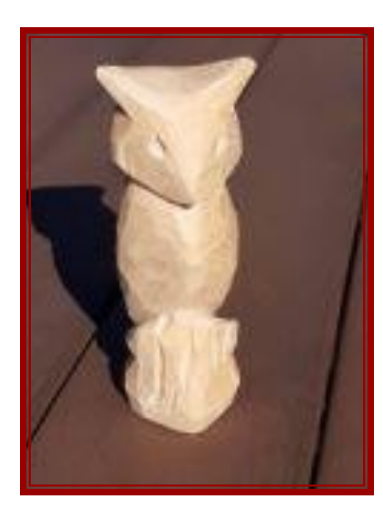
Return To Top